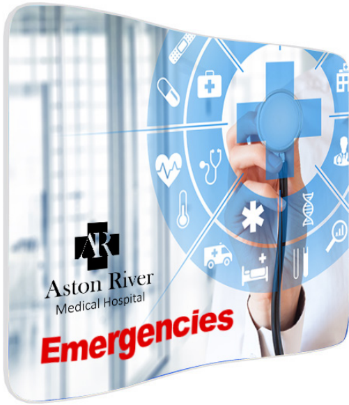
Curved Tension Fabric Display